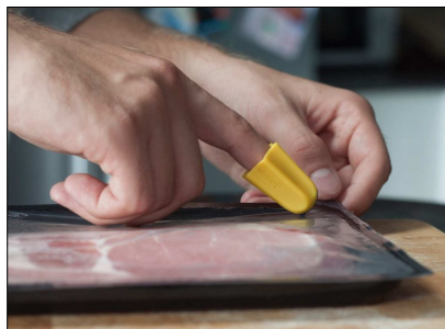
Nimble: The world's first one-finger cutter for opening packaging