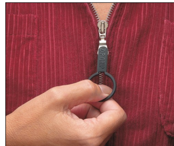
Zip Grips: Opening and closing zips has never been easier