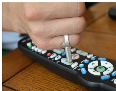
Sixth Digit: Press physical buttons and touchscreens with ease