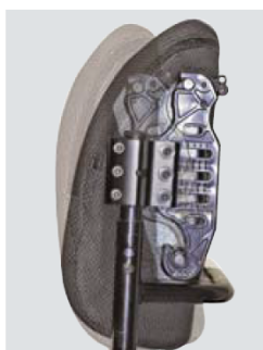
ANGLE: 20° posterior range of back angle adjustment