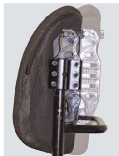
DEPTH: 2" behind back canes