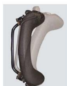
ROTATION: Back may be oriented to accommodate pelvic/trunk rotation