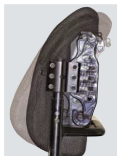
ANGLE: 20° anterior range of back angle adjustment