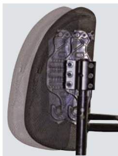
DEPTH: 2" in front of back canes