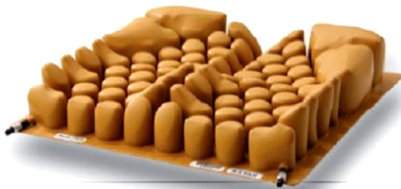
Galaxy Model GXY 1818-2

Introducing an all new wheelchair cushion line from Star Cushion Products, Inc....the Galaxy. The Galaxy is a flame resistant neoprene cushion that combines multi-cellular air technology with a patented, contouring design, fitting the anatomical form. These detailed, contouring features, offer several benefits to aid in the patients' stability and posture, while greatly enhancing a true therapeutic advantage. Simply stated, the Galaxy is a well engineered system, uniquely designed to capture the needs and requirements of our companies' first and foremost importance...the end user!