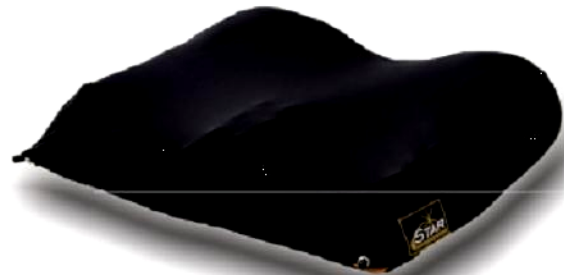
Galaxy shown with Fitted Cover