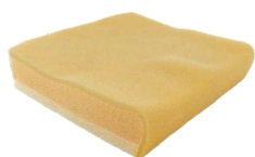
Nxt Kulfit Cushion