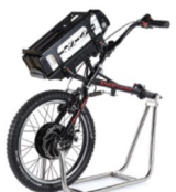
Da Vinci Trail Rider