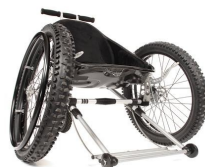
Trekinetic K2 Chair*

*Trekinetic Chair now sold through Mobility Solutions Centre, Dunedin 03 455 1201