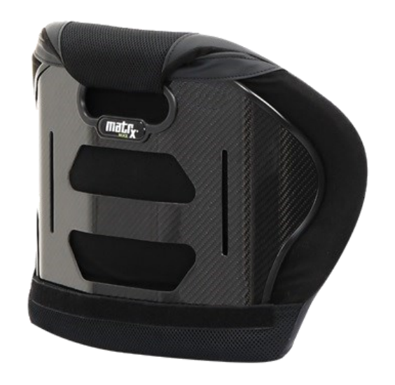
3" CONTOUR DEPTH

The MX2 Carbon Fibre Back Support from Motion Concepts provides superior support and function for active users. Made from a specially engineered lightweight carbon fibre shell for unmatched stability and peak performance.