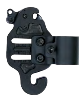
Fixed MiniSet Low profile design compatible with rigid chairs, recommended for tilt/recline applications Requires tools for removal